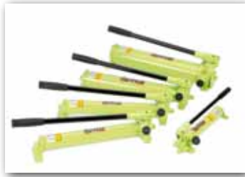
Single Acting Hand Pumps, W.