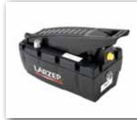
Air Hydraulic Pumps, Z, ZR.