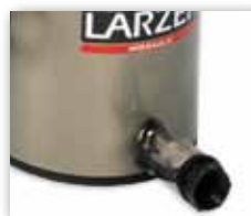
Coupler 3/8"-18 NPT included.